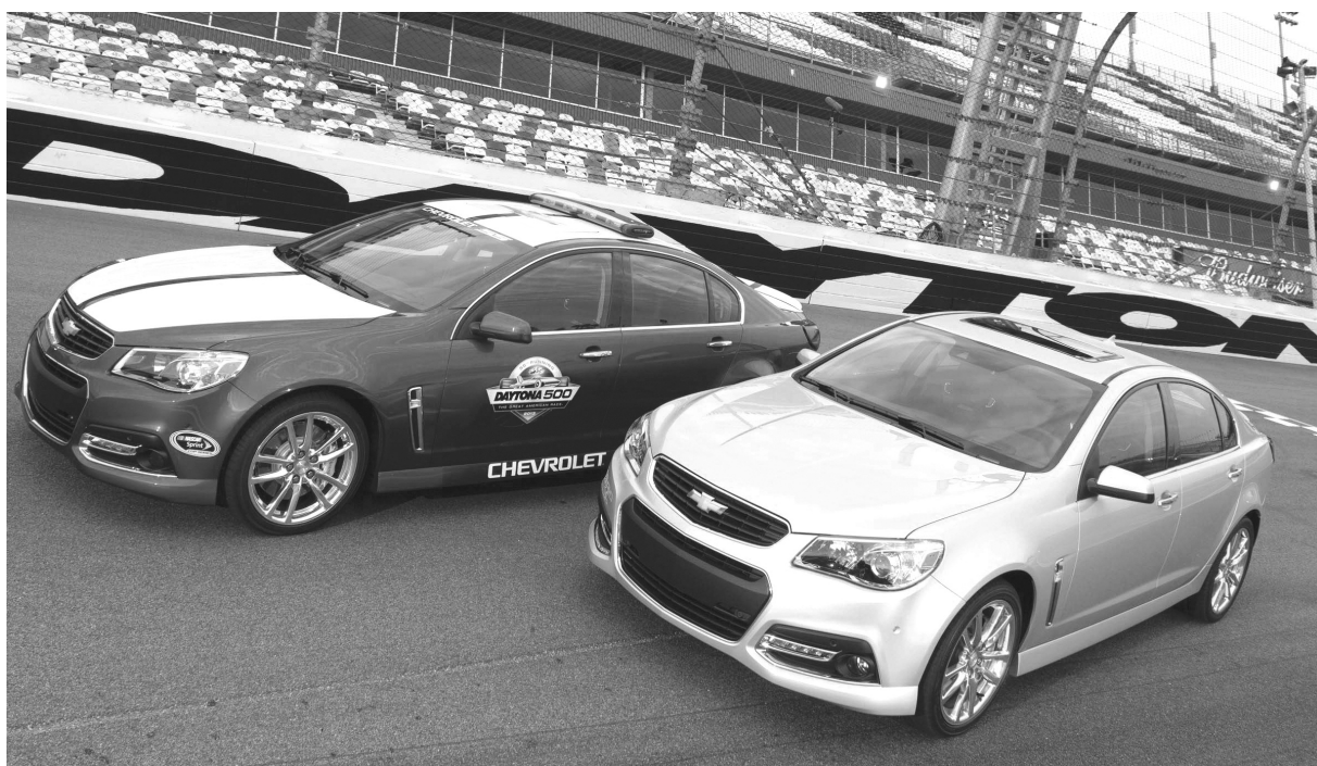
The all-new 2014 Chevrolet SS performance sedan is Chevrolet's first rear wheel drive performance sedan in 17 years. The SS will also be Chevrolet's racing car entry in the 2013 NASCAR Sprint Cup series.